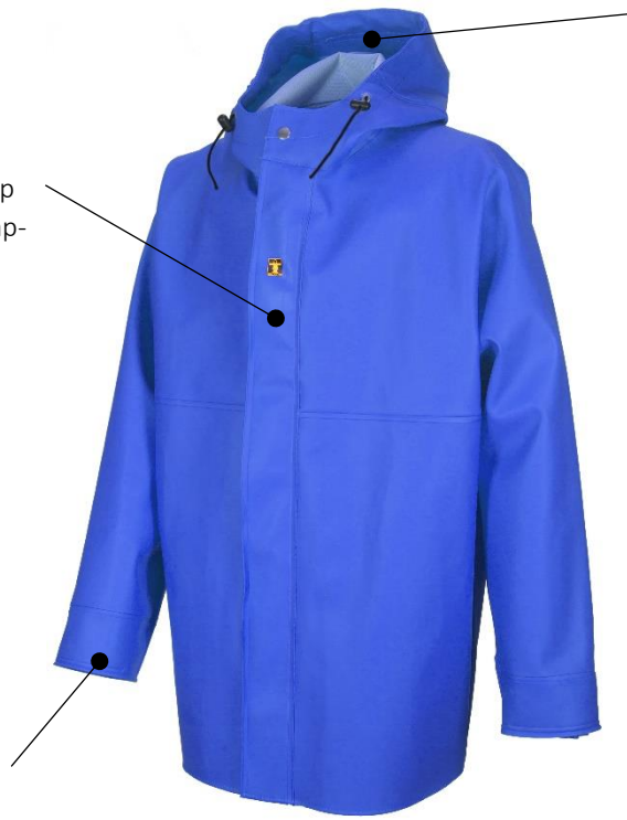
ILLUSTRATION AND INSTRUCTIONS

Snap-fastening elasticated cuffs with gusset