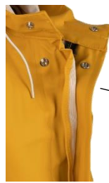
ILLUSTRATION AND INSTRUCTIONS

Big teeth zipper under double flap Hidden stainless-steel press studs fastening.