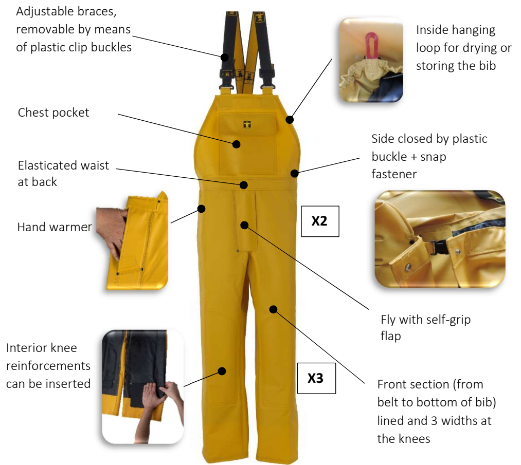
ILLUSTRATION AND INSTRUCTIONS

i For maximum protection, the CBD bib and braces with fly can be worn with a PPE classified jacket, smock or coat..