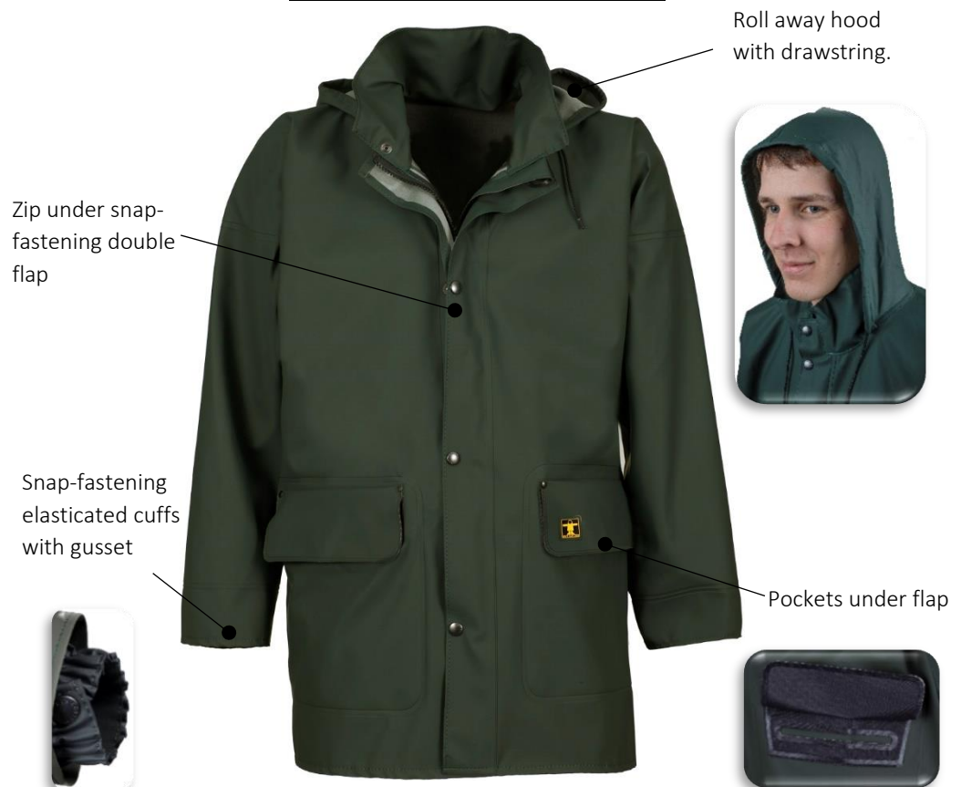
ILLUSTRATION AND INSTRUCTIONS