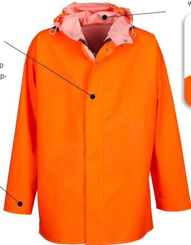
ILLUSTRATION AND INSTRUCTIONS

Snap-fastening elasticated cuffs with gusset