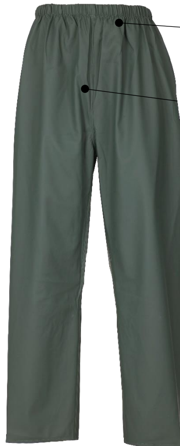
ILLUSTRATION AND INSTRUCTIONS