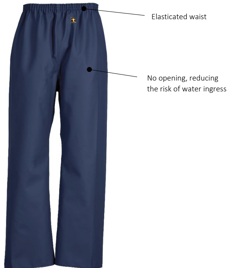
ILLUSTRATION AND INSTRUCTIONS