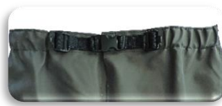
ILLUSTRATION AND INSTRUCTIONS