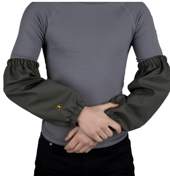
ILLUSTRATION AND INSTRUCTIONS