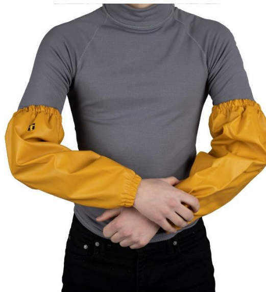
ILLUSTRATION AND INSTRUCTIONS