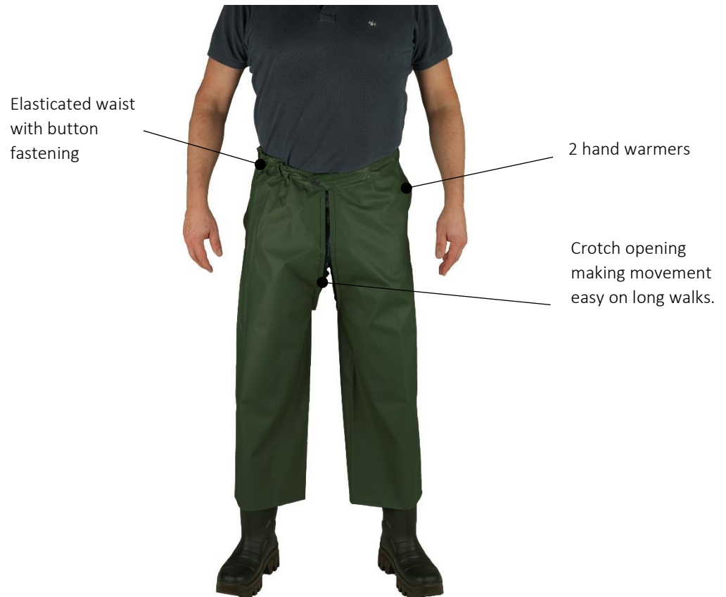
ILLUSTRATION AND INSTRUCTIONS